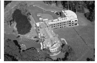
Mountain Villa School