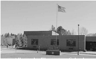
Allamuchy Township School